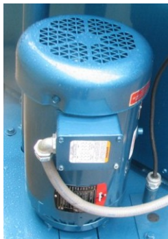
High Output Pump